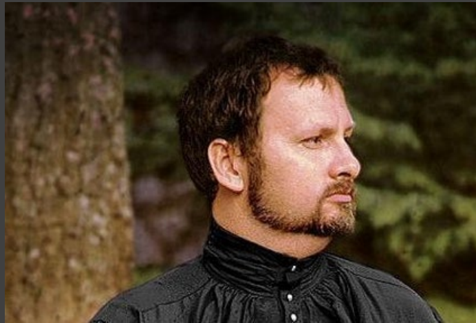
PRINCE PHOENIX (32)

SHADOWMOR, LORD OF NIGHTMARE, rules the Nightmare Dimension.