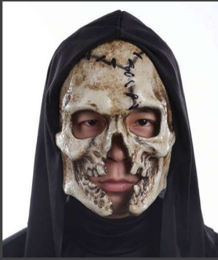
LORD SHADOWMOR (30)