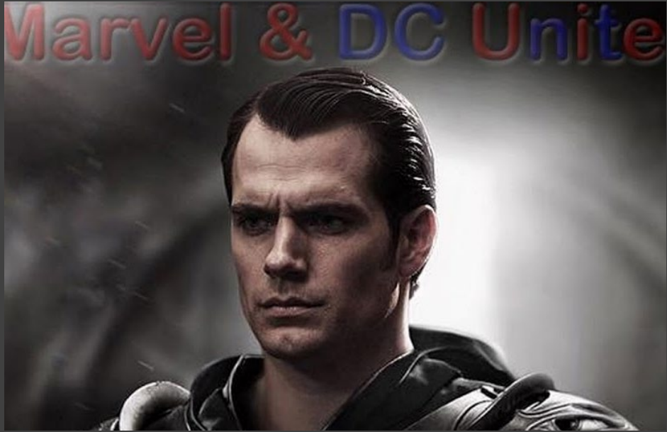
SIR HAVEN (35)

Eric and his friends are summoned to Dreamscape and are given a choice: fight to save Lily, or lose her and open Realworld to evil.