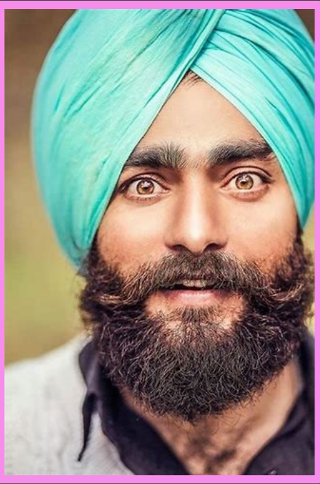
The Mystic Seer, Herbert