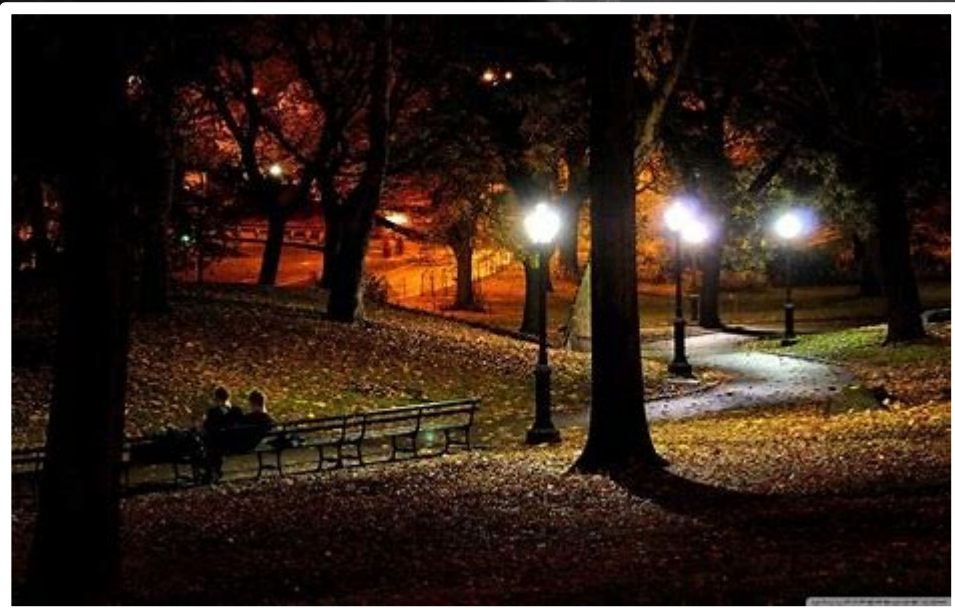
Night in the Park

Pierce kidnaps Tessa's friend, Salem, and uses her to lure Ronnie and Tessa to a park at night.