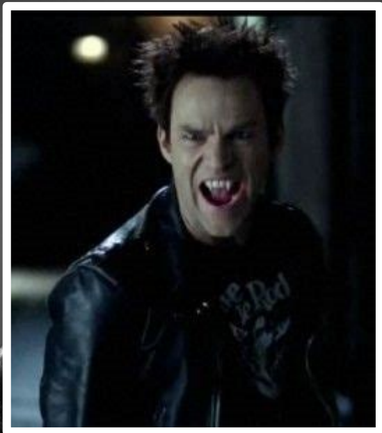
Pierce, The Vampire

It dawns on Ronnie that Pierce is no ordinary fare!